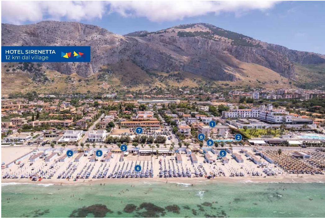
HOTEL SIRENETTA 12 km dal village